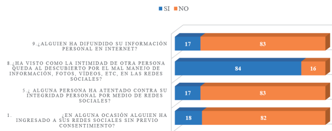
Figure 1. Category: Social networks

1. 82% of students responded that they have not entered their social networks without prior consent; with 18% choosing the option Yes.